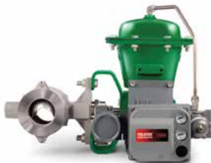
Flangeless body provides a multiclass rating.