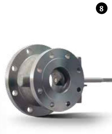
ENVIRO-SEAL® packing, which is available in all Vee-Ball valves, helps meet stringent emission control requirements.