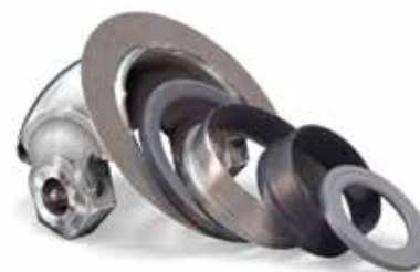
Vee-Ball seal types shown include Flat Metal, TCM (composition), and HD.