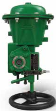
Declutchable manual operator mounts directly to the actuator.