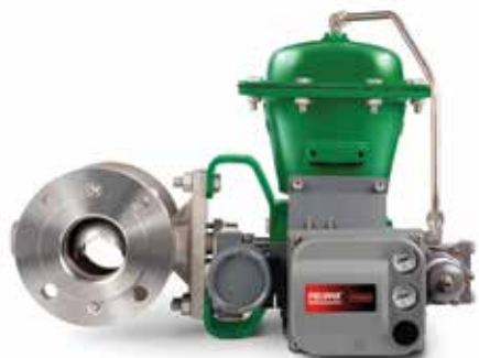
Flanged body design with a Class 150, 300, or 600 rating.