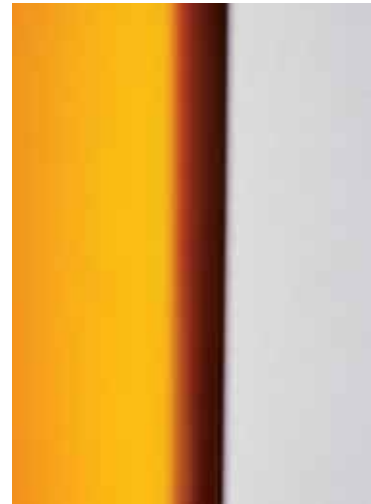
Taper key provides solid ball-to-shaft connection.